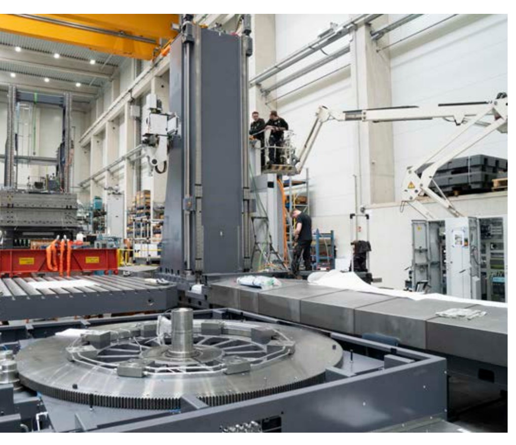
From stable heavy-duty cutting to precise surface finishing, the P-Series offers the highest level of efficient 5-sided machining

More than 2,500 steel grades are now on the market, ranging from structural steels to (non-)alloy steels, tool steels and (high-)tensile steels to stainless and special steels.