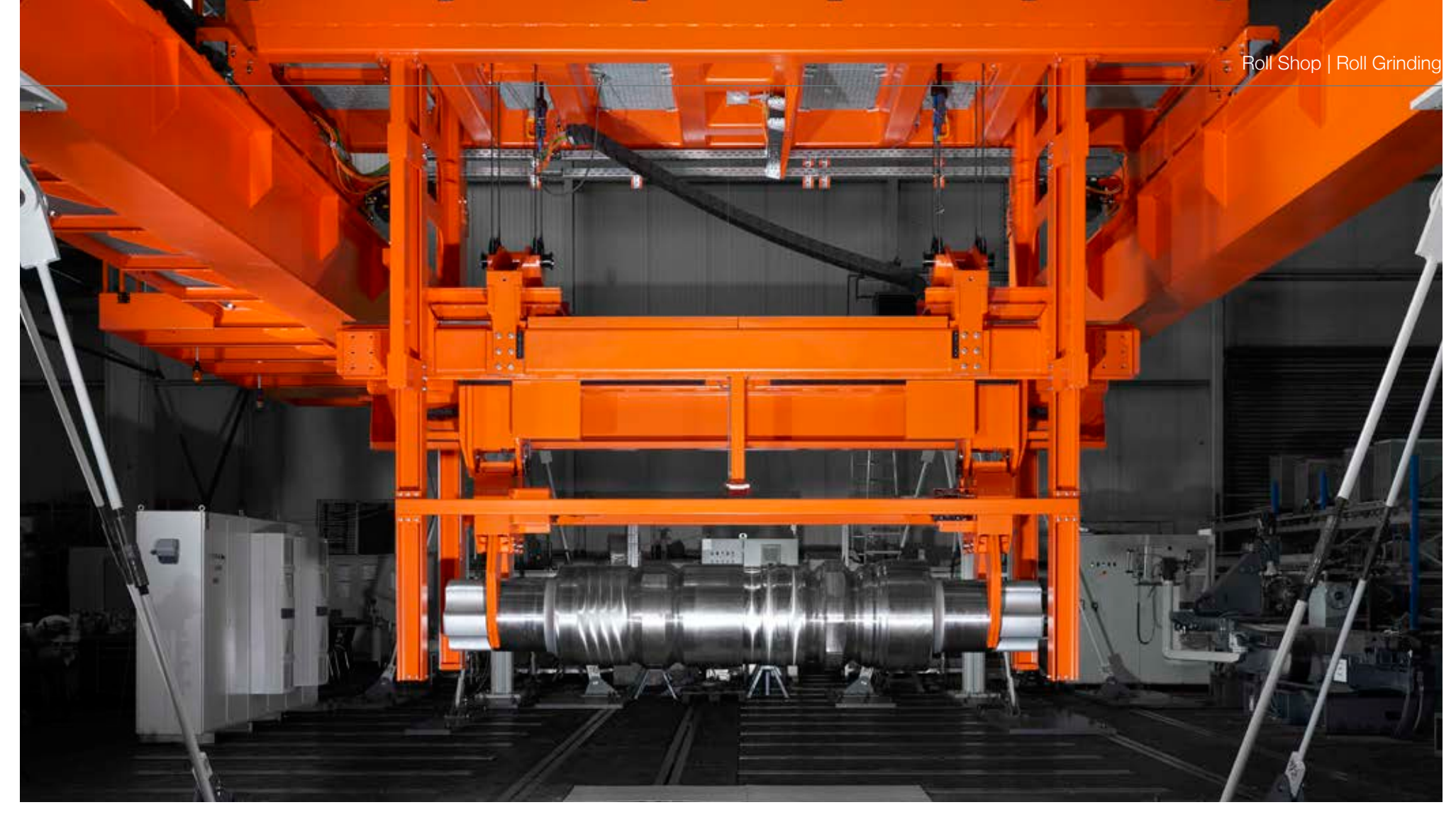
Roll shops comprehensively manufactured by WaldrichSiegen: If you need more than just a powerful roll grinding and texturing machine, WaldrichSiegen is your partner for equipping complete roll shops