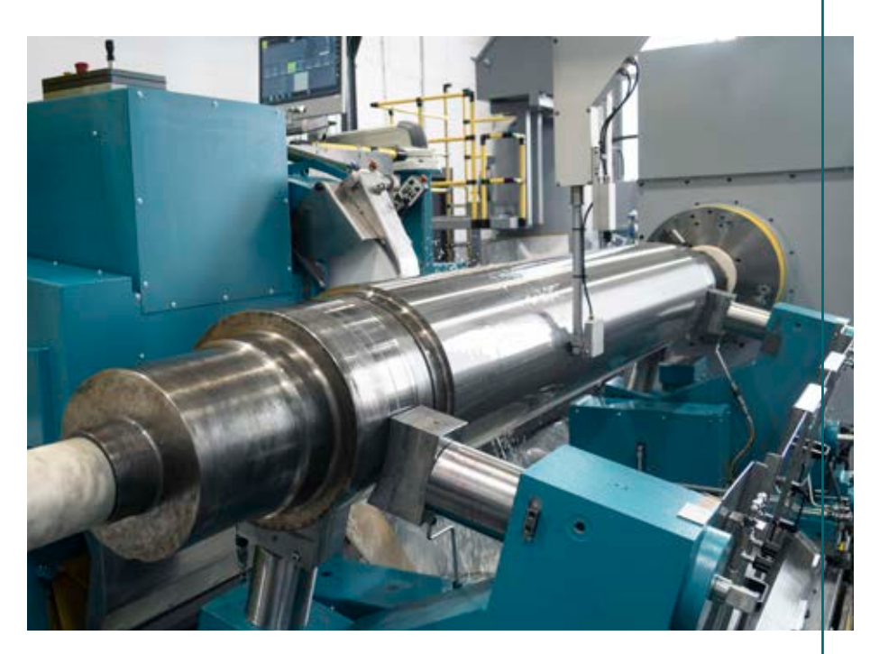
Unrivaled quality, outstanding results and an extremely long service life: The ProfiGrind has been impressing customers all over the world for decades

High-End Technology Provided by WaldrichSiegen