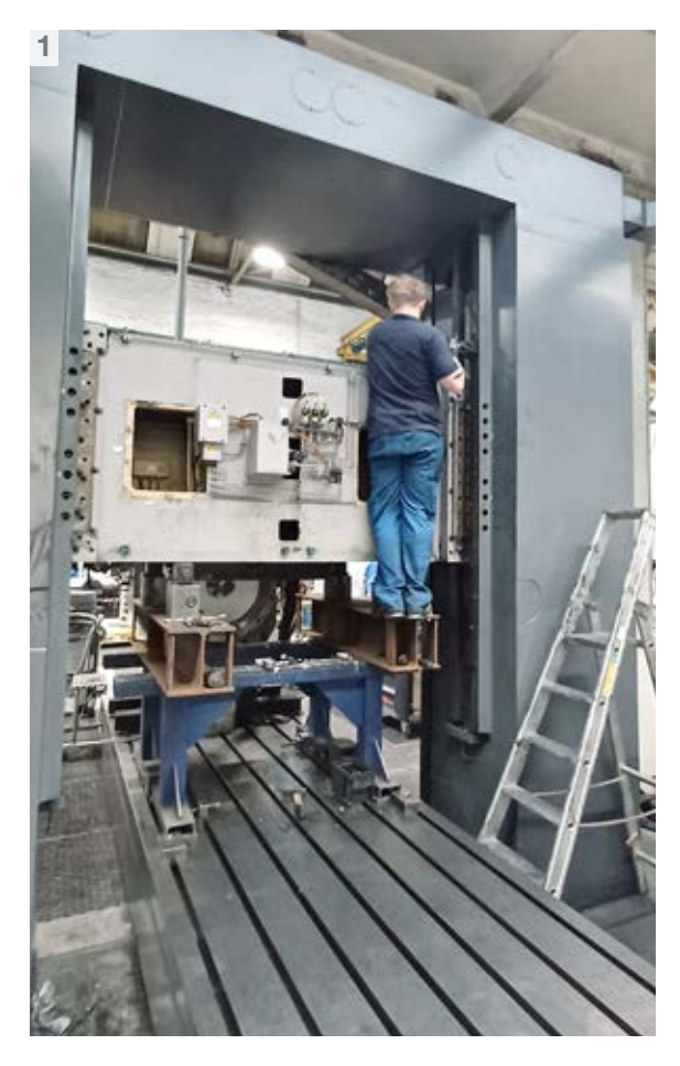
1. Important components and wear parts of the portal milling machine have been conscientiously checked and overhauled by our experts

Furthermore, the electrical system has been completely upgraded to latest standards, which contributes to an increased productivity of the machines and significantly reduces downtimes due to failures.